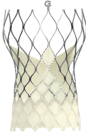
Evolut PRO+ 26 mm Valve